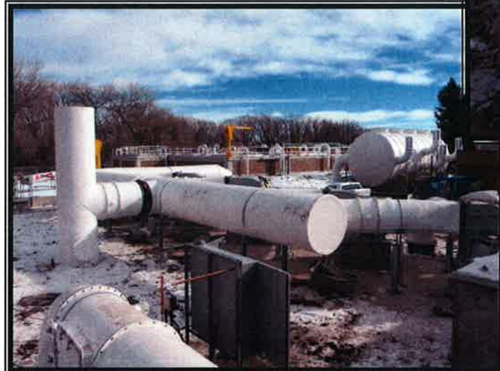
Spunstrand Product at a Water Reclamation Facility