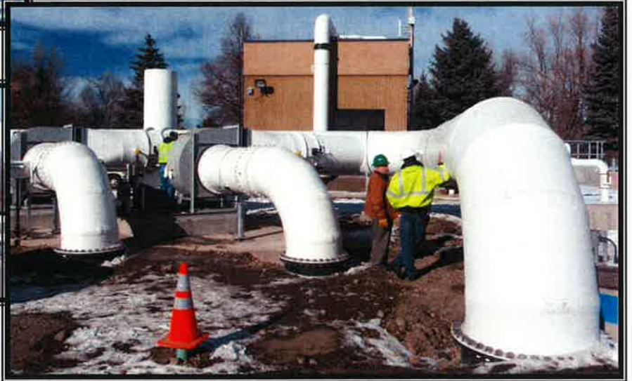
FRP Duct Manifolds