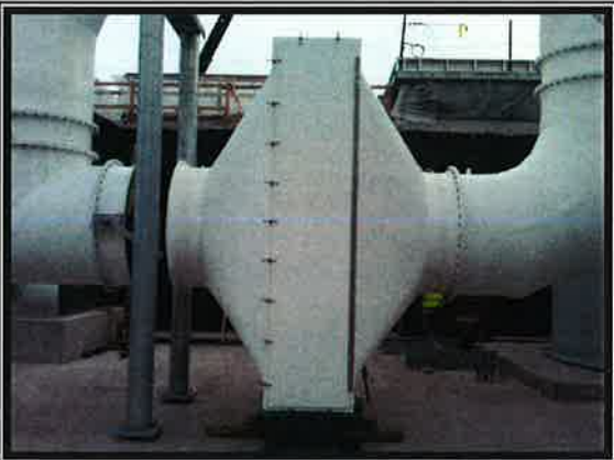
Two Stage Mist / Grease Filtration Unit