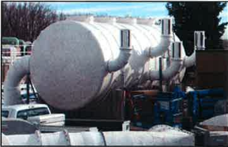
40,000 CFM Carbon Scrubber

S punstrand® Inc. has been manufacturing filament wound fiberglass reinforced plastic ductwork systems for commercial and industrial applications for over fifty years. The standard guide specifications we use are based in the National Bureau of Standards PS 15-69, the SMACNA Thermoset FRP Duct Manual and the RTP-1 applicable standards. We also manufacture to ASME, ASTM, ANSI, Military spec and many custom applications.