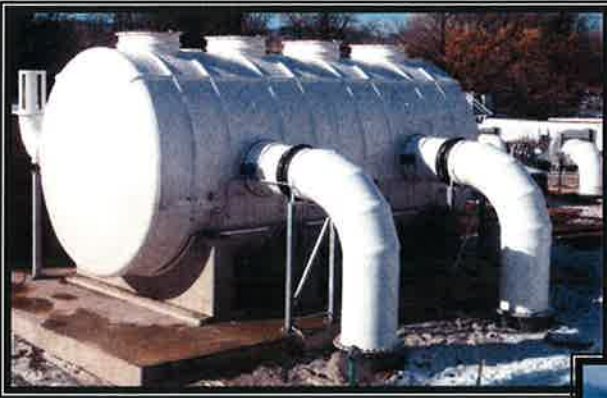
40,000 CFM Scrubber