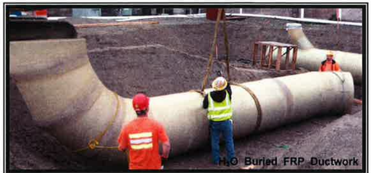
H 2 O Buried FRP Ductwork