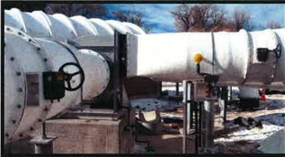
Spunstrand Product at a Water Reclamation Facility