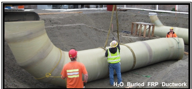
H 2 O Buried FRP Ductwork