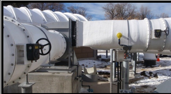
Spunstrand Product at a Water Reclamation Facility