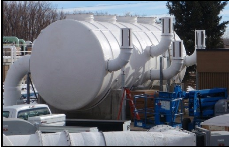
40,000 CFM Carbon Scrubber

S punstrand® Inc. has been manufacturing filament wound fiberglass reinforced plastic ductwork systems for commercial and industrial applications for over fifty years. The standard guide specifications we use are based in the National Bureau of Standards PS 15-69, the SMACNA Thermoset FRP Duct Manual and the RTP-1 applicable standards. We also manufacture to ASME, ASTM, ANSI, Military spec and many custom applications.