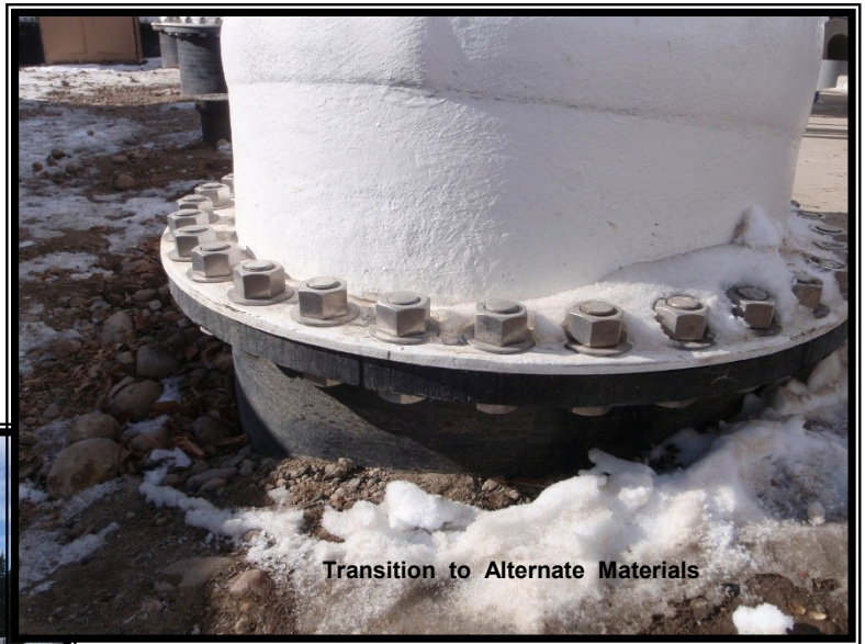
Transition to Alternate Materials