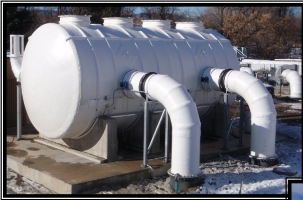
40,000 CFM Scrubber