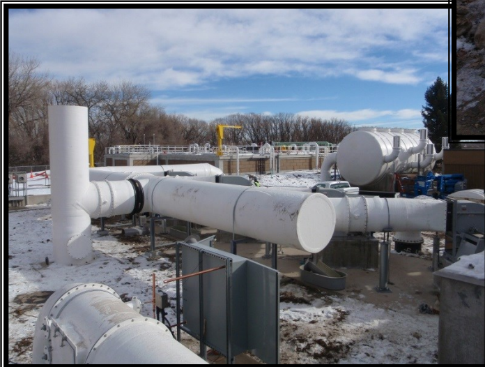
Spunstrand Product at a Water Reclamation Facility