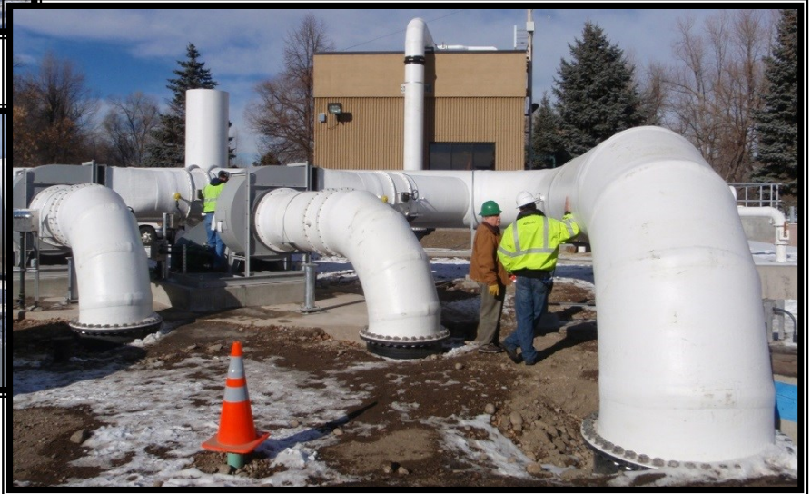
FRP Duct Manifolds